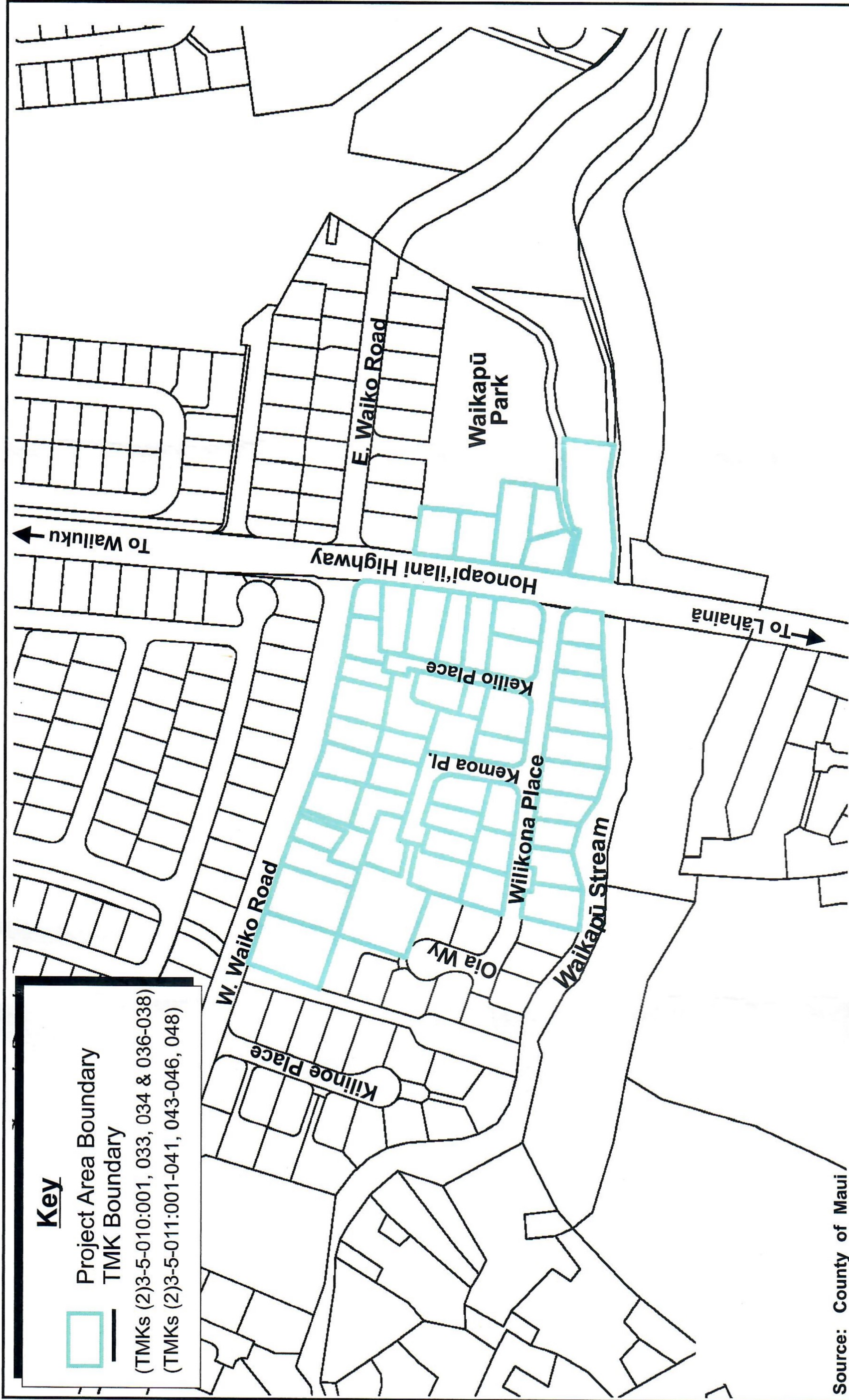
Figure 2 Waiko Road Subdivision Sewer System Project Location Map